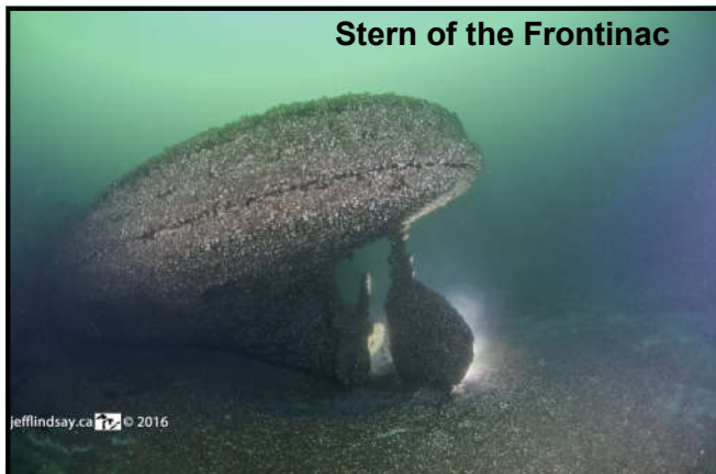
Stern of the Frontenac

All divers will be required to sign a waiver of liability prior departure from the dock.