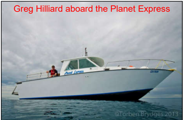
Greg Hilliard aboard the Planet Express

The price per diver is $420 which includes the charter on the "Planet Express" for each day (two dives per day) and accommodations for 2 nights (Friday and Saturday) at Black River Cottages.